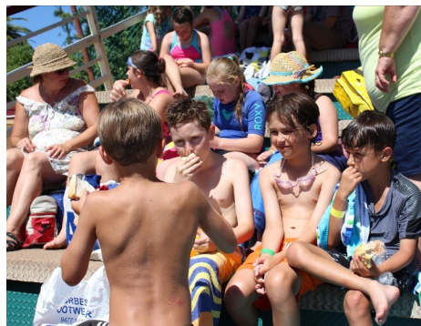
The all-important fruit break before the race.

The many excellent performances at the carnival must surely be due in part to the excellent parent support we received on the day! With most teachers occupied officiating events, having so many parents in attendance helping the students get organised, encouraging participation in events and stepping in for timekeeping roles was priceless. Thank you!