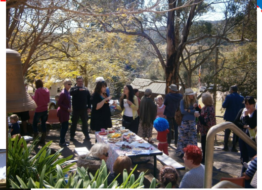
Grandparents enjoying the Sunshine and morning tea