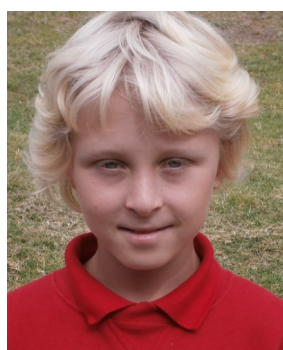
Delfin, 4/5/6 Sports award for excellent gymnastics.