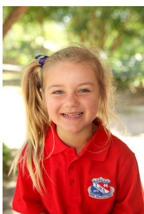
Rio—K-1 Classroom Award for Respect— for being a good friend!