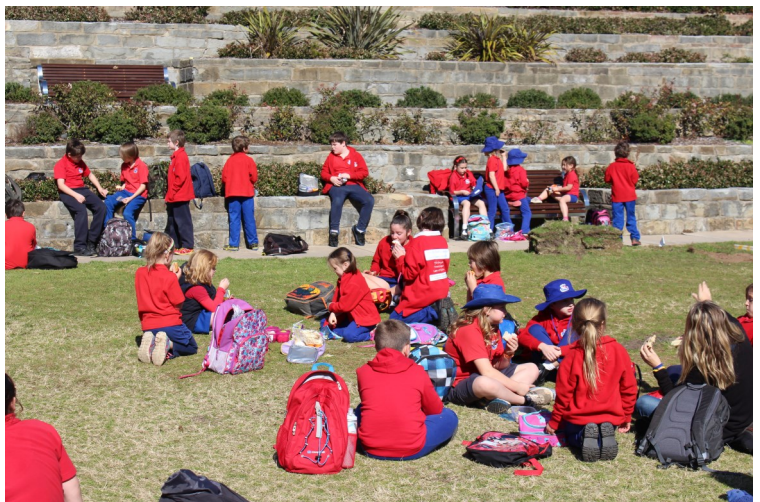
Perfect weather for a post-play, pre-gallery lunch at Civic Park in Newcastle.