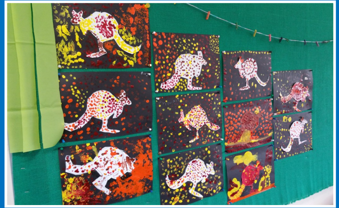
Dot painting in the K-1 room!

Auditions are taking place for the next Valley Artists production "The Family Frying Pan". Please see the attached flyer if you are interested.