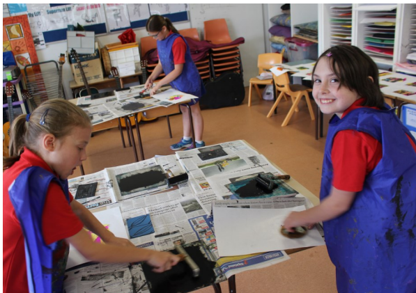
Printers hard at work!