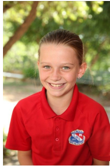
Nirikai - 4/5/6 Li- brary Award for Re- spect. No surprises there!