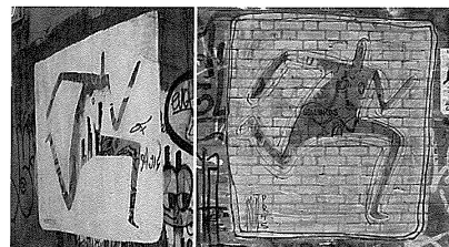
wall art image by Jon Drypzn

Calling all 12 – 16 year olds... don't miss out on this one! design, make and paint your own cool stencil image for posters or walls (your own that is!)