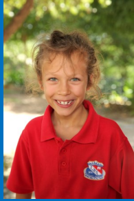
Talim, 2-3 Class- room Award for Responsibility