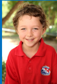
Bela 2-3 Award for Responsibility