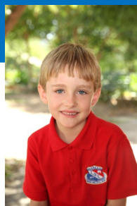
Phoenix, K-1 Sports Award for Responsibility!