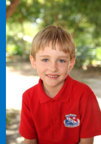
Phoenix, K-1 Classroom Award for Responsibility!