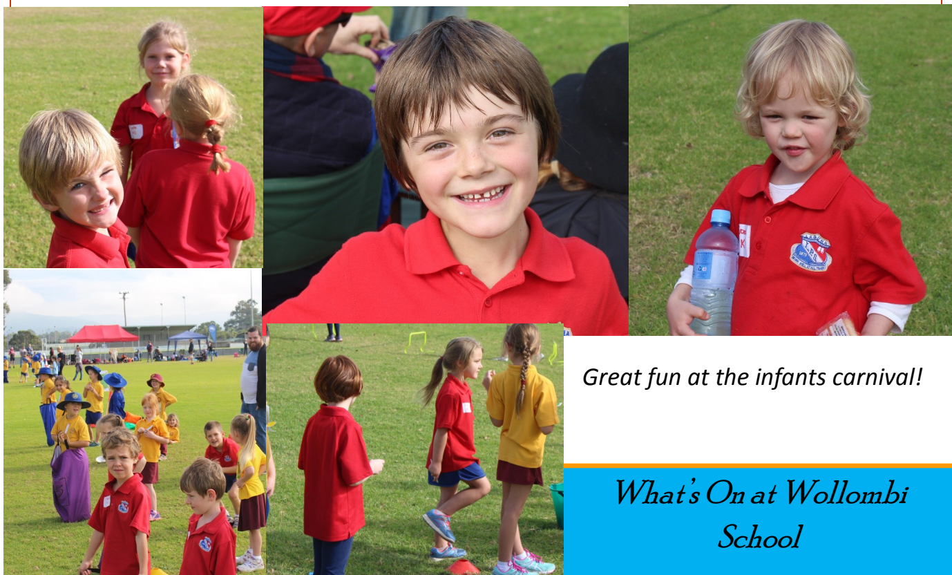
Great fun at the infants carnival!

We look forward to hearing about those students who will represent our school in the Cessnock Zone carnival in the coming weeks.