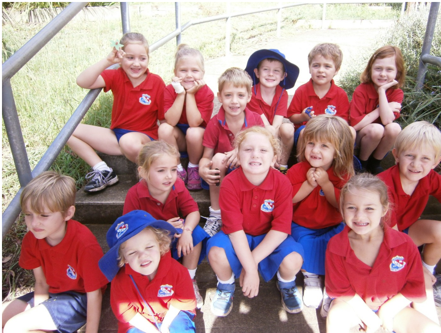
Congratulations to our respectful K/1 Class.

I will be in contact with all Kindergarten parents to organise Best Start interviews for next week. Year 1 are working on 3D shapes and 'th' sounds this week. Kindergarten have just learnt our 'd' sounds and practicing writing our numbers 1-10. Have a great week!