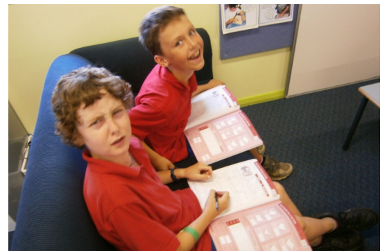
Maths in action - technological and not-so-technological.