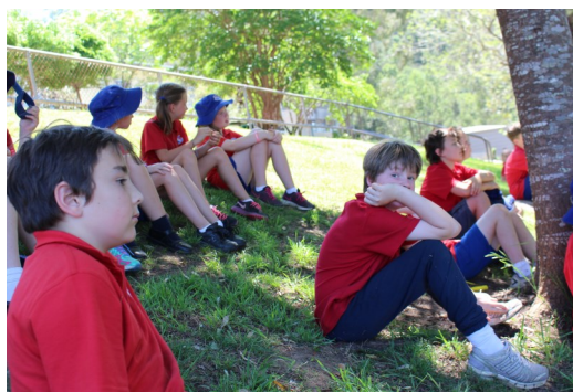
It's nice to find a shady spot on a warm day.

Please label all swimming and school clothes to avoid any change-room confusion. There is usually a few stray items at the end of the day!