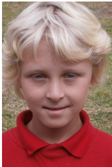
Delfin—4/5/6 Award for being a responsible learner!