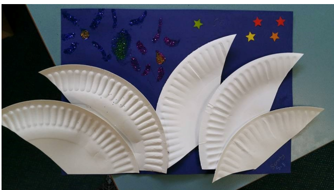
Sydney Opera House!