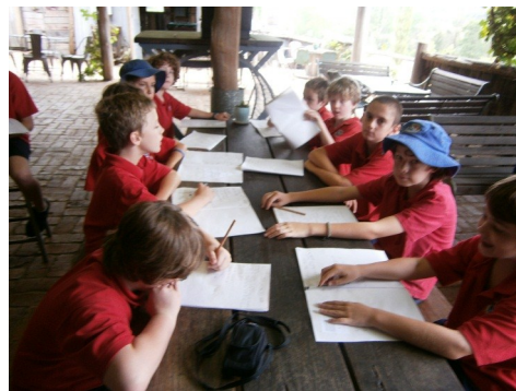
Students applying their maths skills in a real-world context!

"When you can measure what you are talking about and express it in numbers, you know something about it" - Lord Kelvin